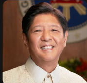
H.E. Ferdinand Romualdez Marcos Jr. President of the Republic of the Philippines