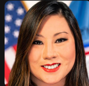
Hon Caroline D. Pham Commissioner, U.S. Commodity Futures Trading Commission