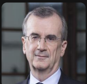
François Villeroy de Galhau* Governor, Banque de France *attending virtually