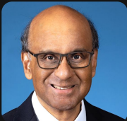
Tharman Shanmugaratnam President of the Republic of Singapore