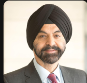
Ajay Banga President, World Bank