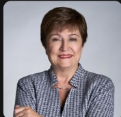
Kristalina Georgieva Managing Director International Monetary Fund