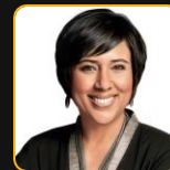
Barkha Dutt Television Journalist & Author Mojo Story

3. It's your worst PR crisis! What's the story you need to tell? An EXCLUSIVE 101 on 'Navigating a PR storm' Masterclass from none other than: