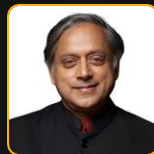
Dr Shashi Tharoor Member of Parliament & Chairman of the Parliamentary Standing Committee on External Affairs Republic of India

3. It's your worst PR crisis! What's the story you need to tell? An EXCLUSIVE 101 on 'Navigating a PR storm' Masterclass from none other than: